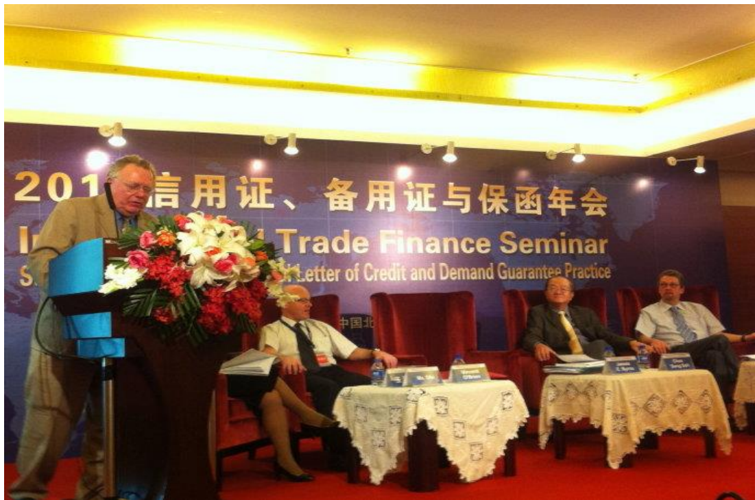
2012 China Annual LC and Demand Guarantee Practice Survey