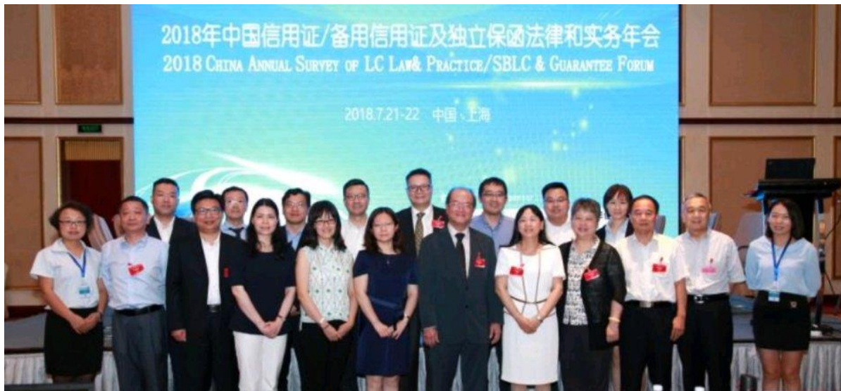
2018 China Annual Survey of LC Law & Practice/SBLC & Guarantee Forum